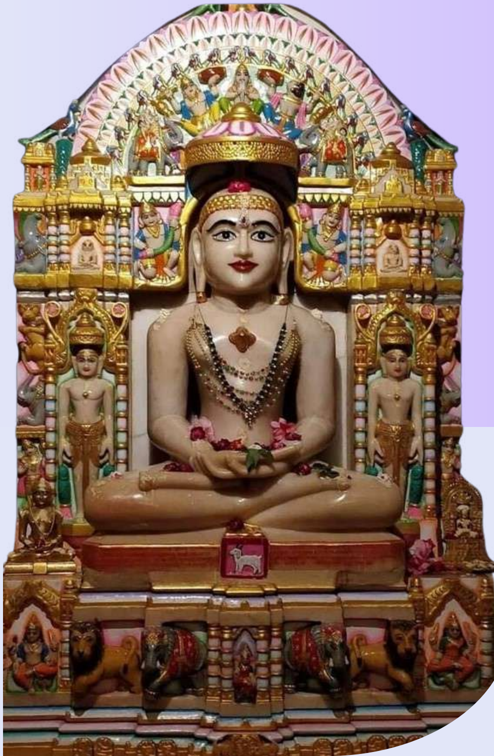
Pratima of Kunthunath Bhagwan at Jinalaya in Raipur, Chattisgarh. India